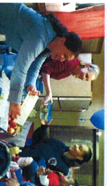
Nursing students organized a health fair in the family shelters.

Programming in the family shelters expanded to include a training component for nursing students and more focused parenting and nutritional counseling.